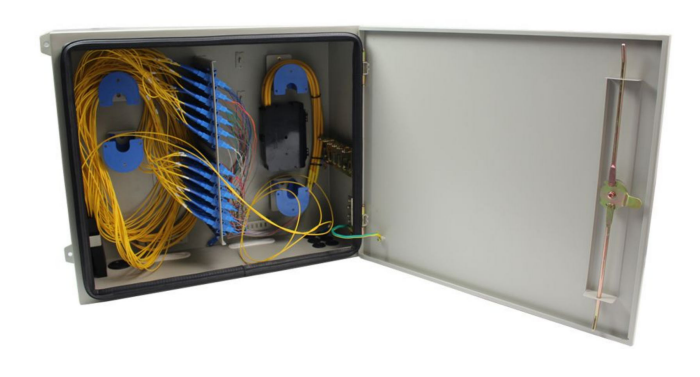
Fig. 1 Splice and termination box