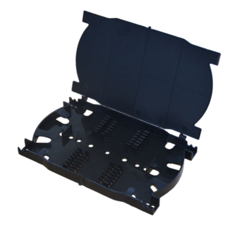
Fig. 2 Splice trays