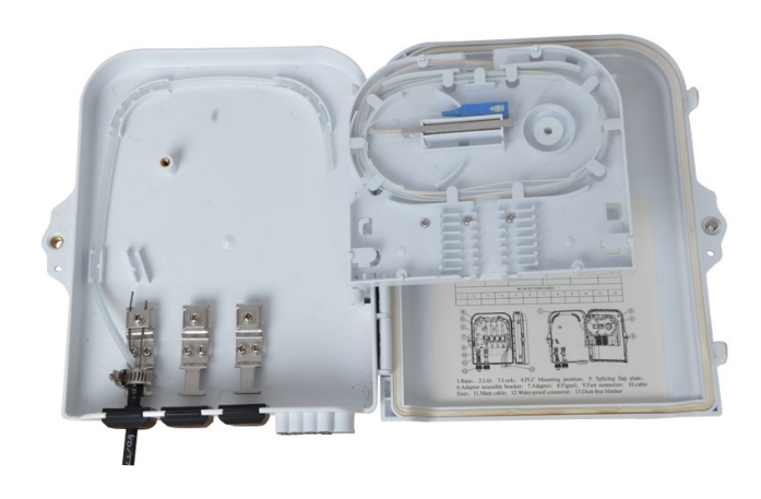
3 Input Ports