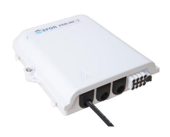
3 Input Ports